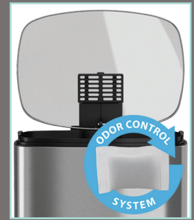
Odor Filter Compartment*