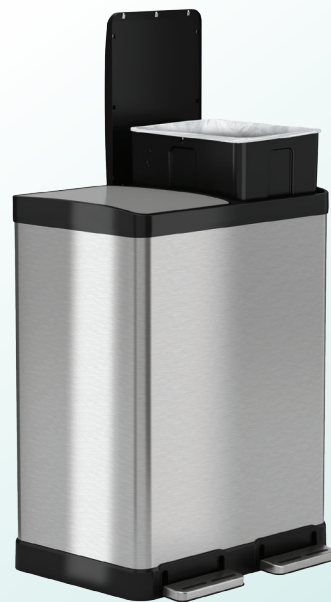
Stainless Steel Dual-Compartment Combination Recycle/Trash Can 16 Gallon (2 x 8 Gallon)