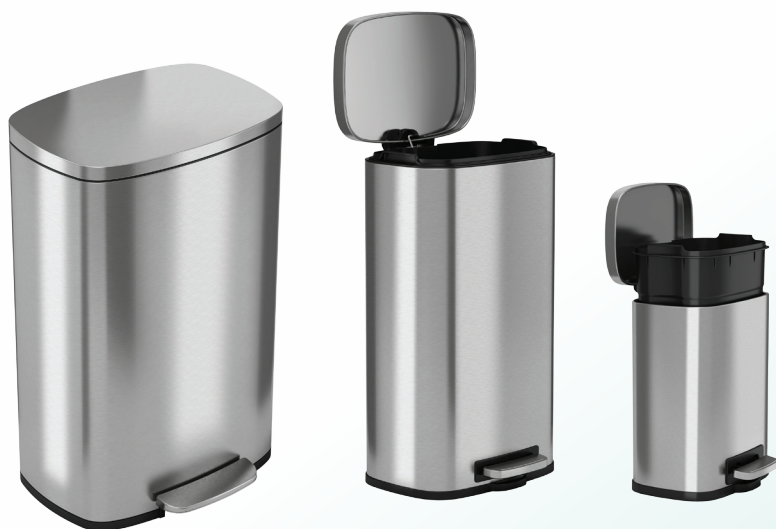
Stainless Steel Step Trash Can 1.32 / 8 / 13 Gallon

Introducing a new line of decorative step pedal waste receptacles, featuring smooth pedal operation and gentle and silent lid close.