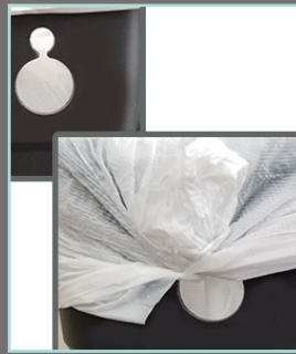
Tuck & Hold Bag Retention