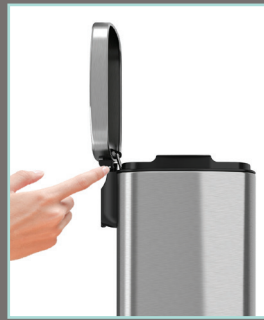
Lid Stay-Open Mode*